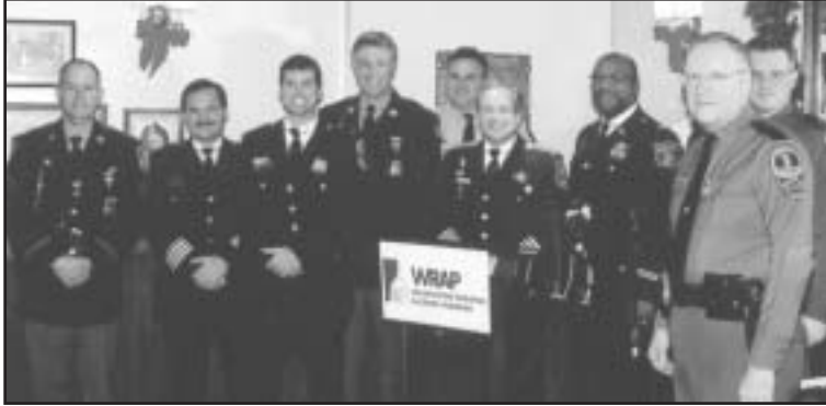
2002 Holiday Campaign co-host Loudoun County Sheriff Stephen Simpson (at podium) gathers area law enforcement leaders to demonstrate their unified fight against impaired driving at the launch of WRAP’s 2002 Holiday SoberRide program.

“808 Use SoberRide on New Year’s Eve” read The Washington Post headline (1-3-03) in reporting on WRAP’s efforts to remove more than 800 would-be drunk drivers from Greater Washington’s roadways on New Year’s Eve (8 pm - 4 am) alone this winter. This unparalleled level of ridership (which is a near doubling of WRAP’s New Year’s Eve ridership in either of the last two years) translates into plucking a potential drunk driver off of this area’s highways every 36 seconds on New Year’s Eve.