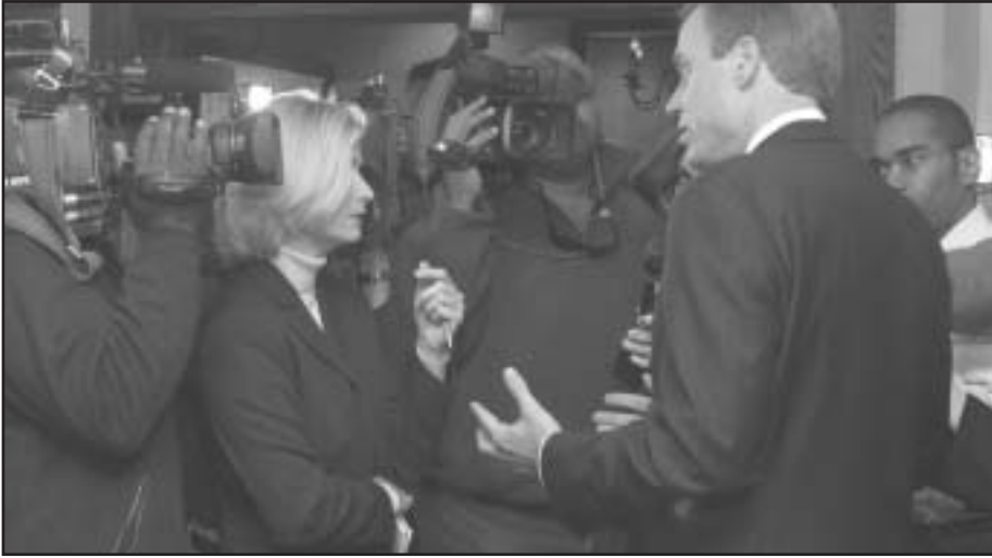
Governor Warner is surrounded by media following his detailing of his 2003 traffic safety legislative agenda at WRAP's 2002 Law Enforcement Awards.

In addition to receiving the Law Enforcement Awards, each of the 2002 WRAP honorees also received two complementary Washington Wizards tickets (courtesy of the Washington Wizards) and a $ 25 prepaid gas card (courtesy of Exxon Mobil). ■