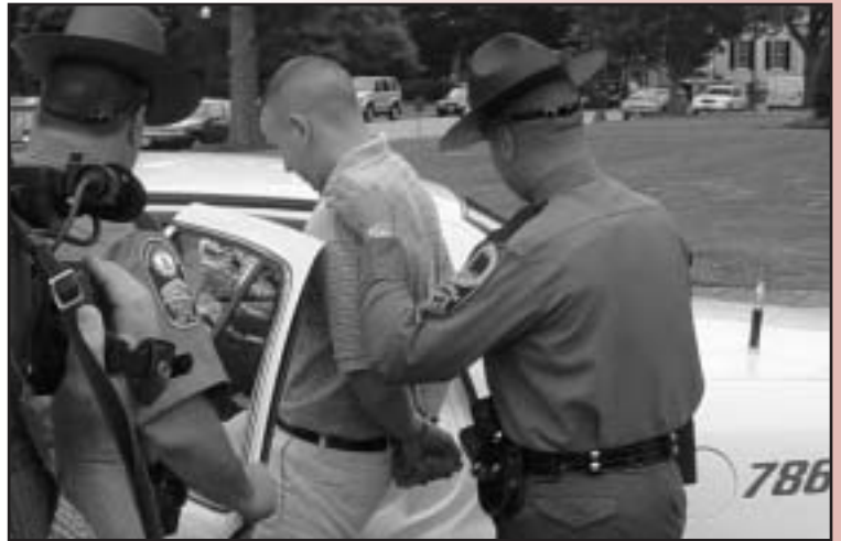
Members of the Virginia State Police and Capitol Police stage a mock sobriety checkpoint for members of the media to launch Virginia's Checkpoint Strikeforce campaign.

The impetus behind this highly focused, zero tolerance law enforcement effort is the fact that as is occurring nationally, drunk driving is on the rise in Virginia.