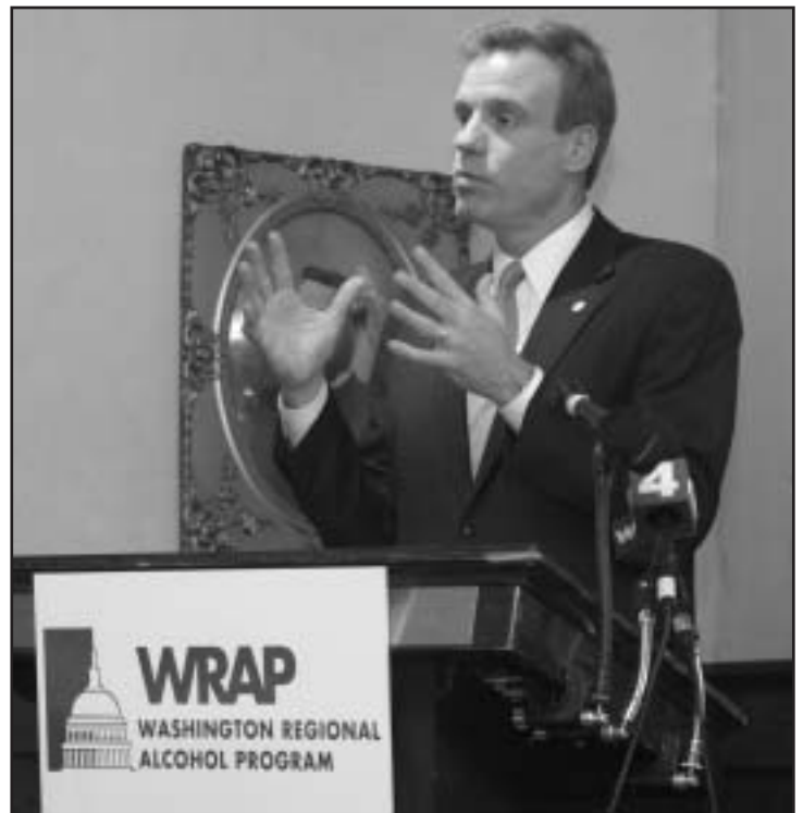
Virginia Governor Mark Warner addresses the many attendees at WRAP's fifth-annual Law Enforcement Awards ceremony.