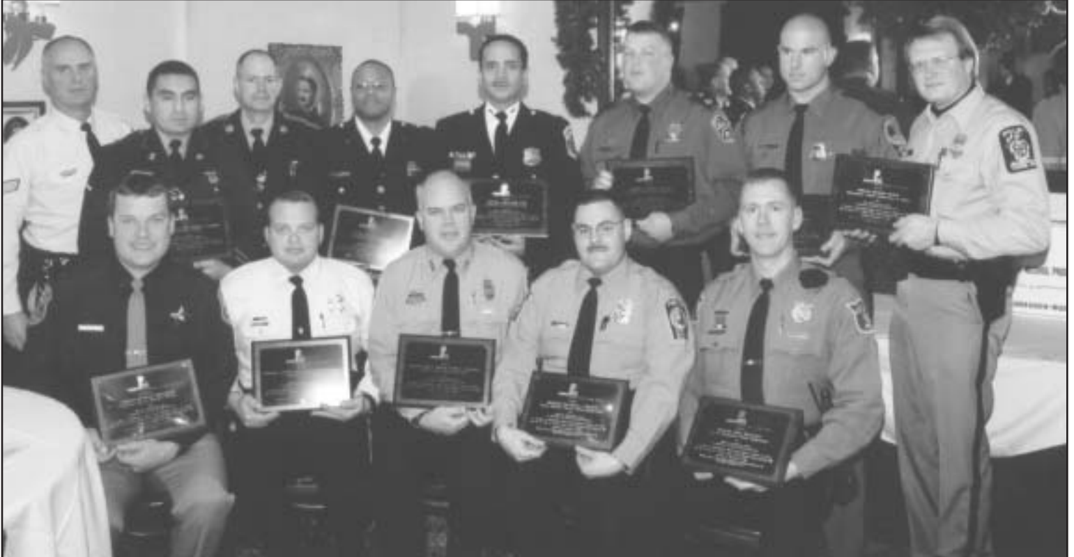
2002 WRAP Law Enforcement Award winners gather following the December 2002 ceremony.