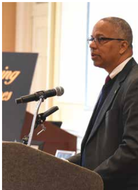
Maryland Lieutenant Governor Boyd Rutherford addresses the audience at the 2016 "Maryland Remembers" ceremony in Annapolis.

For more information on Noah's Law and Maryland's comprehensive efforts to combat impaired driving, visit: www.towardzerodeathsmd.com/noah . ■