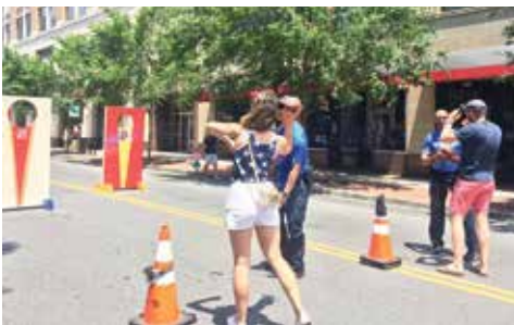
WRAP joining Arlington County, Virginia Police Department for their anti-DUI event as part of Clarendon's "All American Bar Crawl" on July 1, 2017 in Arlington, Virginia.