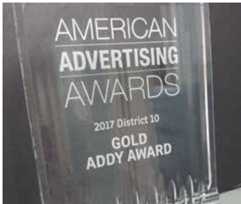
WRAP's managed online campaign celebrating designated drivers (#CelebrateDD)—part of the region's Checkpoint Strikeforce campaign—earns a 2017 ADDY Award.