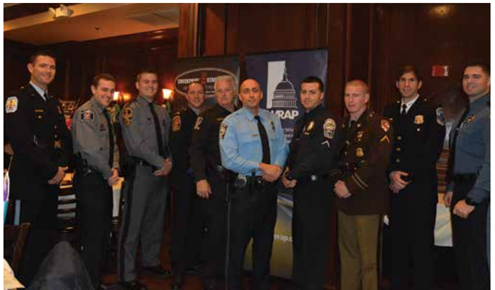
Recipients of WRAP’s 2016 Law Enforcement Award of Excellence for Impaired Driving Prevention gather at WRAP’s 19th-annual awards event in McLean, Virginia.