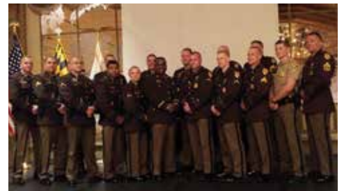
Honorees from the Maryland State Police gathering at the 16th-annual Maryland Impaired Driving Enforcement Awards on June 4, 2017 in Greenbelt, Maryland. (WRAP serves as project director of the event.)