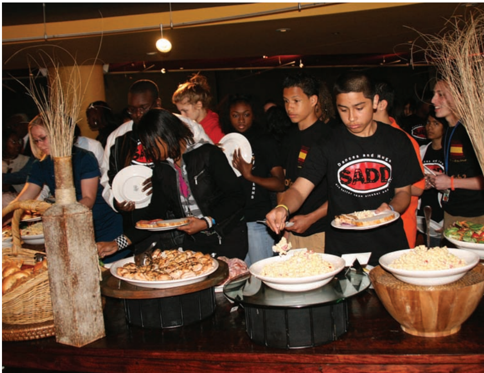
Area high school students enjoying an Acela Club lunch at WRAP's 2009 GEICO Student Awards.

*SADD: Students Against Destructive Decisions.