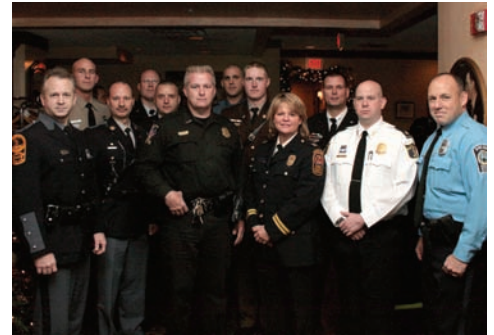
Recipients of WRAP's 2008 Law Enforcement Awards posing after the winter ceremony.