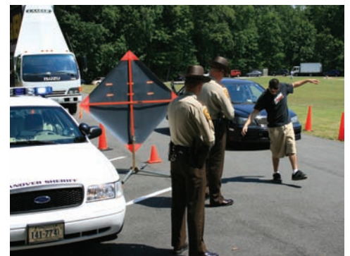
Members of the Hanover County Sheriff's Department performing a mock sobriety checkpoint at the launch of Virginia's 2008 Checkpoint Strikeforce campaign.