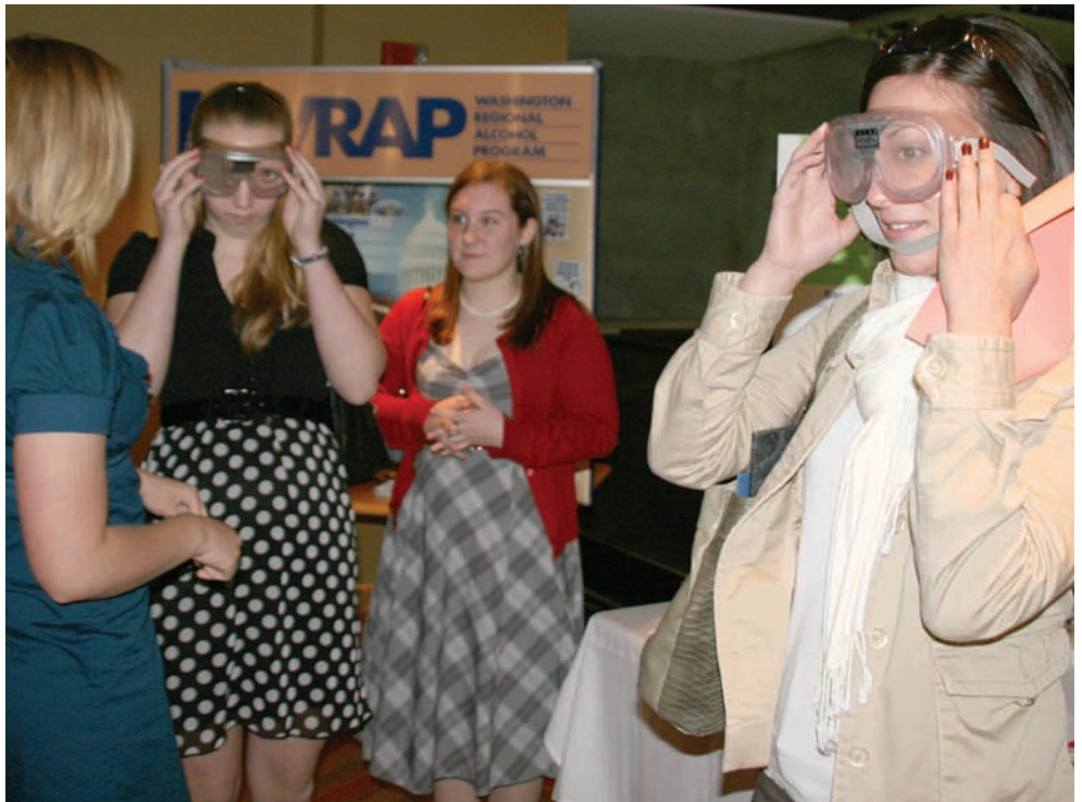
Local high school students trying on Fatal Vision goggles at WRAP's 2009 GEICO Student Awards.

“In 2007, nearly one-third of all teen drivers killed in this country’s traffic