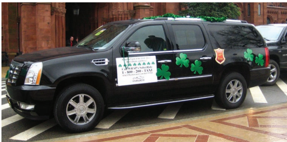
WRAP's decorated parade vehicle (courtesy of the Easterns Automotive Group and the Washington Area New Automobile Dealers Association) positioned to take part in the 2009 D.C. St. Patrick's Day Parade and as a means of promoting WRAP's St. Patty's Day SoberRide campaign.

"If you plan on getting tipsy to celebrate the inauguration, don't expect to get a free taxi home," reported NBC4 (1-9-09) and regarding WRAP's standing intent to not expand its SoberRide program beyond its set and initial holiday times and focus