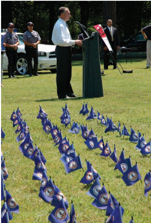
Virginia Governor Timothy Kaine launching Virginia's 2008 Checkpoint Strikeforce campaign. The Virginia flags in the forefront represented the 378 alcohol-related fatalities Virginia recorded in 2007.

For more information, visit www.checkpointstrikeforce.net . ■