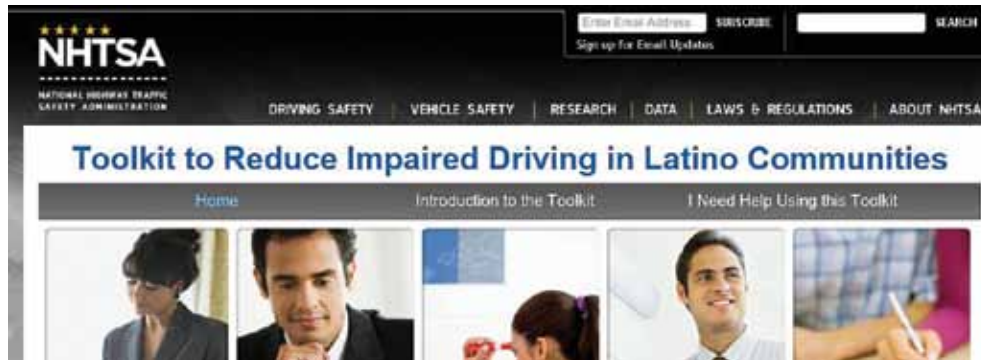
NHTSA's new online resource guide, "Reducing Impaired Driving Fatalities and Injuries in Hispanic Populations."

Unveiled at the nonprofit organization's fall 2011 Annual Meeting, WRAP produced the 24-page, "2009–2011 Highlights" showcasing WRAP's work in combating drunk driving and underage drinking between October 1, 2008 through September 30, 2011 (and viewable online at http://www.wrap.org/pdfs/2011AnnualReport.pdf ).