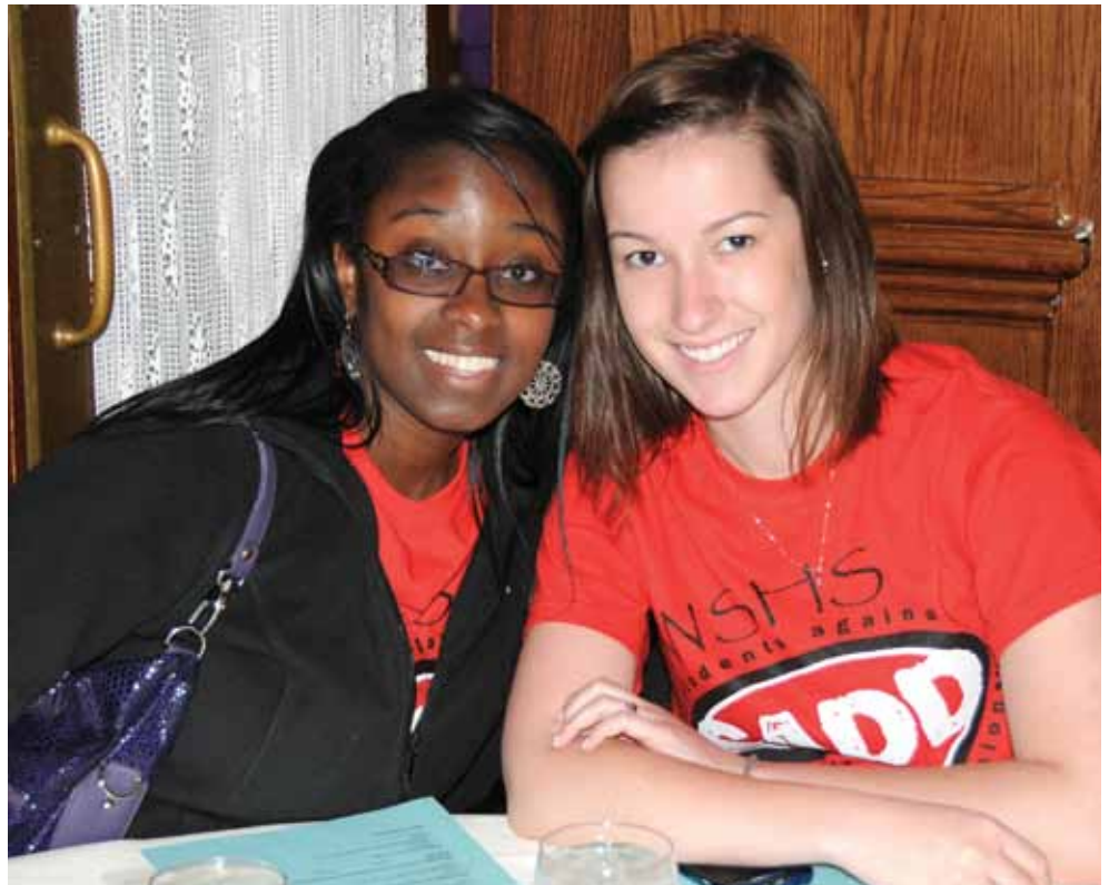
Students from West Springfield High School's SADD Club gather at WRAP's 2012 GEICO Student Awards.

1420 Spring Hill Road, Suite 250 McLean, Virginia 22102 tel: 703.893.0461 fax: 703.893.0465 email: wrap@wrap.org web: www.wrap.org www.soberride.com