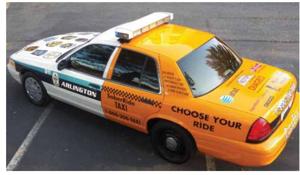
WRAP's inaugural "Chooser Cruiser"—a joint initiative with the Arlington County Police Department and Red Top Cab.

This winter, WRAP and some of Greater Washington's anti-drunk driving leaders unveiled a new, innovative and specially-outfitted motor vehicle designed to deter impaired driving in the metro area.