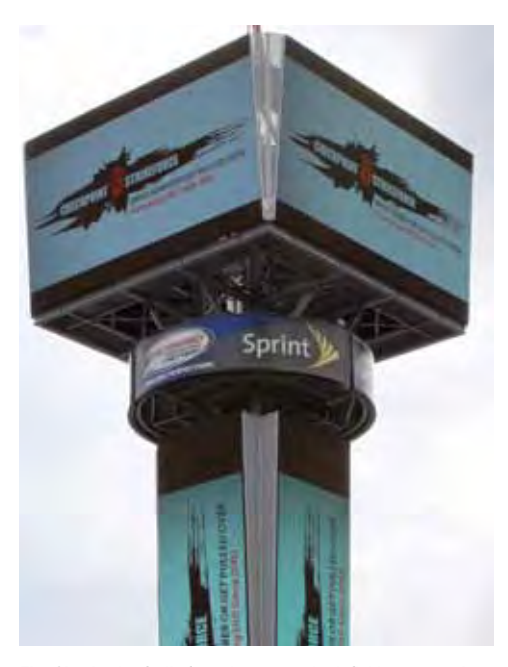
The Checkpoint Strikeforce logo atop the infield tower at the Richmond International Raceway.