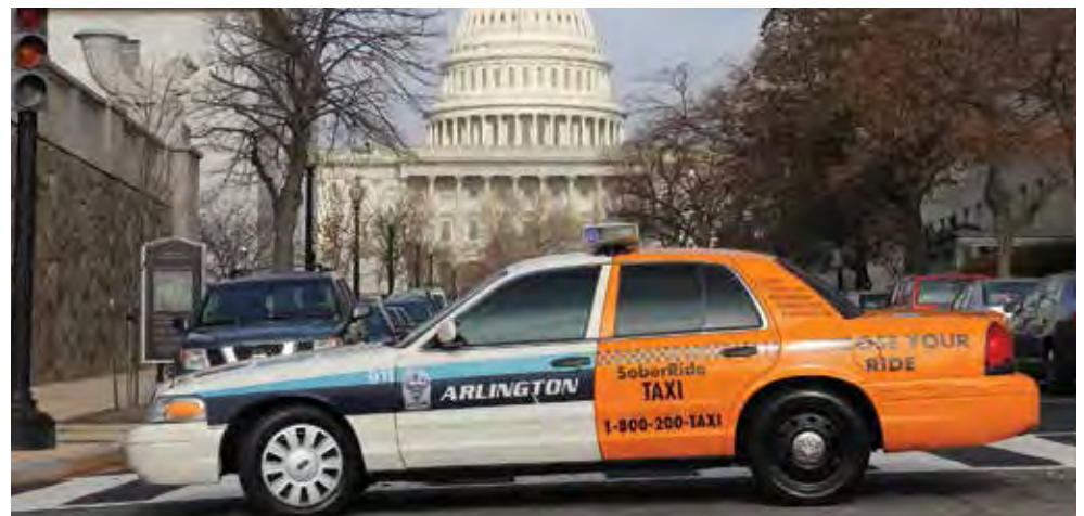
WRAP's "Chooser Cruiser" displayed on Capitol Hill in December as a means of promoting both safety as well as the organization's 2013 Holiday SoberRide ® campaign.

WRAP partnered with the offices of U.S. Representative Gerry Connolly (VA) and the U.S. Capitol Police to display WRAP's half cab/half cop car, the "Chooser Cruiser" on Capitol Hill on December 5, 2013. WRAP partner Diageo helped promote the event via a "street team" in D.C. that day distributing Holiday SoberRide ® cards. ■