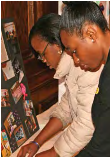
Student participants in WRAP's 2013 GEICO Student Awards set-up their display at the 21st-annual regional competition in Washington, D.C.

In addition, WRAP bestowed Honorable Mention honors to the following Greater Washington area high school student groups: Fairfax High School, Leadership/Student Government Association, Fairfax County, VA; Gar-Field Senior High School, SADD Club, Prince William County, VA; James Madison High School, SADD Club, Fairfax County, VA; Wards 3 & 4 D.C.