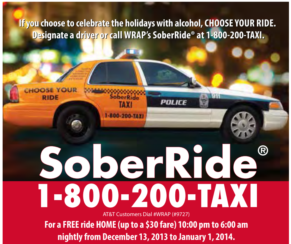
WRAP's award-winning "Chooser Cruiser" as depicted in the organization's poster for its 2013 Holiday SoberRide® campaign.

8300 Boone Boulevard, Suite 730 Vienna, Virginia 22182 tel: 703.893.0461 fax: 703.893.0465 email: wrap@wrap.org web: www.wrap.org www.soberride.com