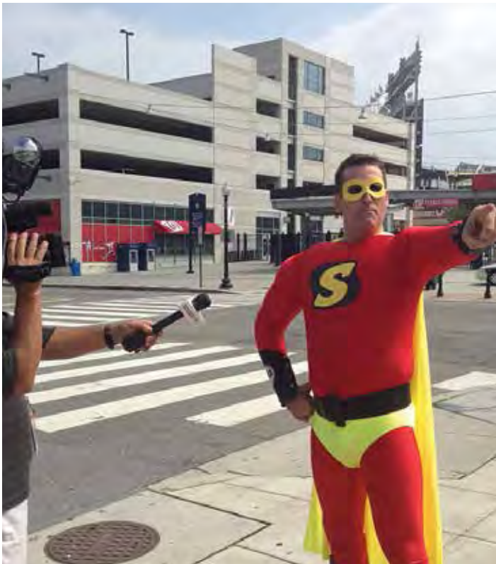
WUSA9 (CBS-TV) interviews the Checkpoint Strikeforce campaign’s new superhero, Soberman, outside of Nationals Park in Washington, D.C. in August.

For more information, visit www.checkpointstrikeforce.net . ■