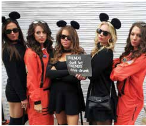
Costumed participants in Arlington's October 31, 2015 Halloween bar crawl.