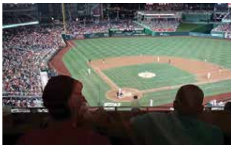
WRAP Members and volunteers at Nationals Park's Mayor's Suite (courtesy of the District of Columbia's Mayor's Office) for the Washington Nationals' September 3, 2015 home

WRAP reached nearly 7,000 Greater Washington area high school students in fiscal year 2015 and with the nonprofit organization's school-based Alcohol Awareness for Students program—a multimedia outreach program using an interactive PowerPoint presentation, video and Fatal Vision Goggles to educate Greater Washington's teenagers and young adults about the dangers and consequences of underage drinking and drunk driving.