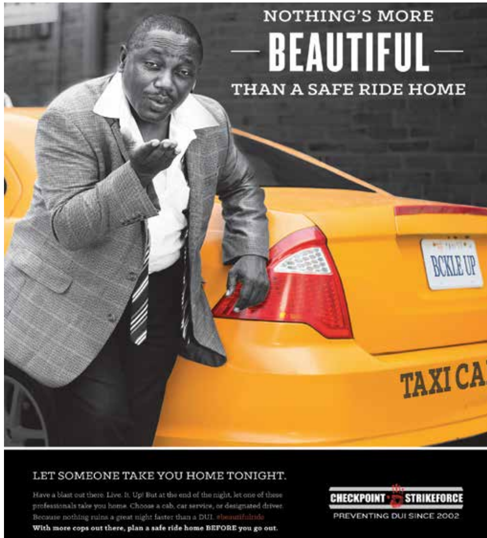
2015 Checkpoint Strikeforce campaign poster celebrating real area cab drivers as being “Beautiful” designated sober drivers.

Markedly increased awareness of DUI enforcement combined with greater planning and use of “safe rides home after being out drinking” in Maryland and Virginia appear to be amongst the dividends of the region’s revamped 2015 Checkpoint Strikeforce campaign.