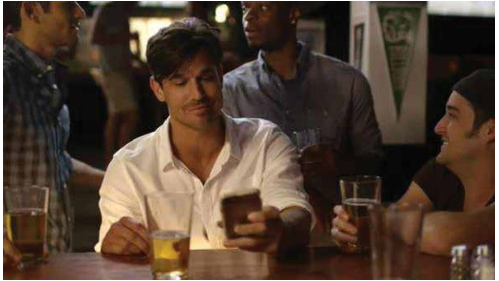
Image from 2015 Checkpoint Strikeforce campaign television spot celebrating the region's “Beautiful” designated sober drivers.

In addition to “Beautiful” spots running on Maryland and Virginia radio and TV stations as well as both digitally and out-of-home, the 2015 Checkpoint Strikeforce campaign featured a “Beautiful” tour around both states where designated sober drivers were publicly thanked for providing a safe ride home. Tour stops included Annapolis, Arlington, Baltimore, College Park, Hagerstown, Landover,