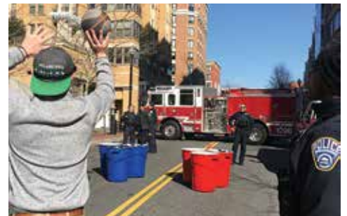
Scene from WRAP helping to staff the Arlington County Police Department's March 10, 2018 Anti-DUI Event as part of Arlington's "Shamrock Crawl."