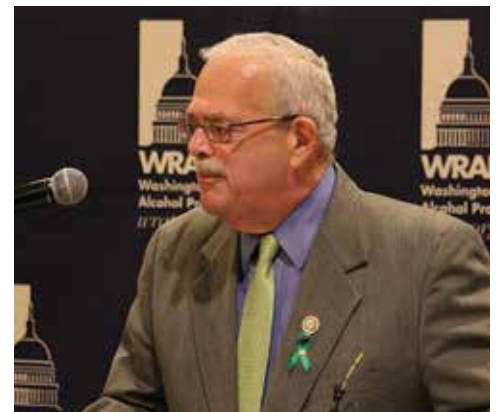
U.S. Representative Gerry Connolly (D-VA) speaks at WRAP’s 20th-anniversary Law Enforcement Awards on December 15, 2017 in McLean, Virginia.