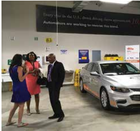
Scene from WRAP's attended briefing by partner the Virginia Department of Motor Vehicles on June 27, 2018 in Sterling, Virginia and on the agency's supported drunk driving prevention Driver Alcohol Detection System for Safety (DADSS) program.