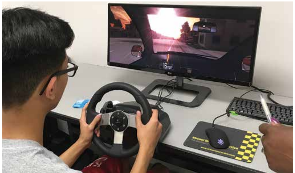
A student tries a distracted driving simulator as part of WRAP's June 4, 2018 Youth Safety Event at Robert E. Lee High School in Springfield, Virginia.

(Such a new youth outreach initiative is in addition to WRAP's continuing alcohol education program, Alcohol Awareness for Students , which, this fiscal year alone, has already reached over 4,000 students with this youth education effort using in-school, multi-media programming educating teenagers and young adults about the dangers and consequences of underage drinking and drunk driving.) ■