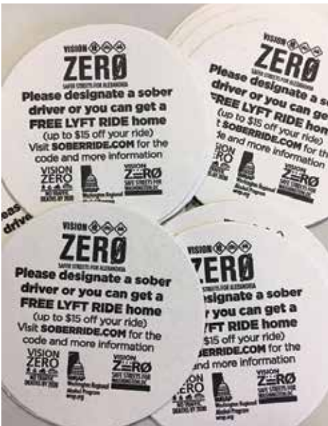
July 4th, 2018 coasters developed and distributed by the Alexandria, Virginia Department of Transportation & Environmental Services promoting WRAP's Independence Day SoberRide® campaign.