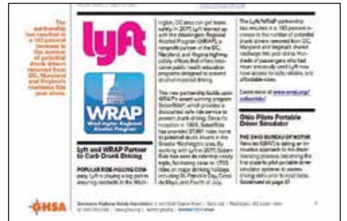
WRAP and Lyft's SoberRide partnership was featured in the Governors Highway Safety Association's (GHSAs) October 2018 newsletter, "Directions in Highway Safety" (see: http://www.ghsa.org/resources/lyft-WRAP ).