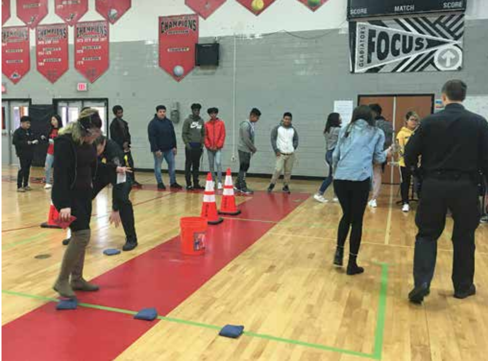
Students, wearing Fatal Vision Goggles, test their motor skills via a spectrum of simulated alcohol impaired activities as part of WRAP's April 6, 2018 Youth Safety Event at Northwood High School in Silver Spring, Maryland.

Building on both the success and partnership of WRAP's previous GEICO Student Awards—which, for 24 years, honored Washington-metropolitan area high school student groups promoting alcohol and drug-free lifestyles to their peers—WRAP this year launched its new, in-school, interactive and GEICO-resourced youth safety events addressing topics ranging from underage drinking, teen driving, bullying and date violence.