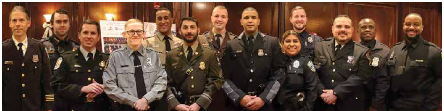
Recipients of WRAP's 2022 Law Enforcement Award of Excellence for Impaired Driving Prevention gather at the nonprofit's Law Enforcement Awards & Holiday Campaign Kick-Off on December 16, 2022 in Tysons, Virginia.

Sponsors of WRAP's 2022 Law Enforcement Awards & Holiday Campaign Kick-Off included The Beer Institute, Breakthru Beverage Washington, D.C., Foundation of Advancing Alcohol Responsibility, GEICO, George Washington University Hospital, Glory Days Grill, Interstate Moving | Relocation | Logistics and Lyft. ■