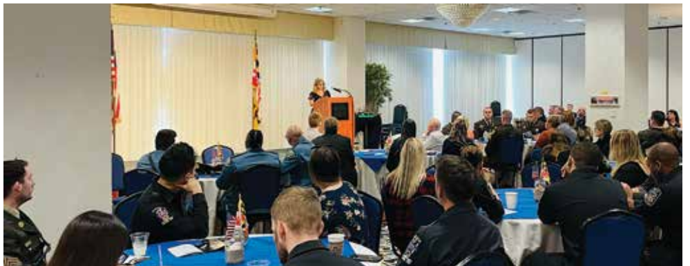
Maryland's 21st-annual Impaired Driving Enforcement Awards held on October 30, 2022 in Ocean City, Maryland honoring law enforcement for their work in impaired driving prevention. (WRAP serves as project director of the Maryland Highway Safety Office event.)

Learn more about the MDOT MVA's Highway Safety Office at ZeroDeathsMD.gov or on Facebook, Twitter and Instagram at @ZeroDeathsMD . ■