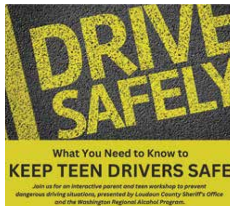
Although subsequently postponed to a later date, WRAP partnered with the Loudoun County Sheriff's Office to develop the interactive parent and teen workshop, "Keep Teen Drivers Safe"—part of the Loudoun County Public Schools' Mental Health and Wellness Parent Series—originally scheduled for April 26, 2023 in Ashburn, Virginia.