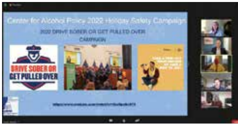
WRAP's Kurt Erickson (center) on November 15, 2022 highlighting the nonprofit's multi-level traffic safety programming over the winter holidays via the Center for Alcohol Policy's webinar on holiday safety.