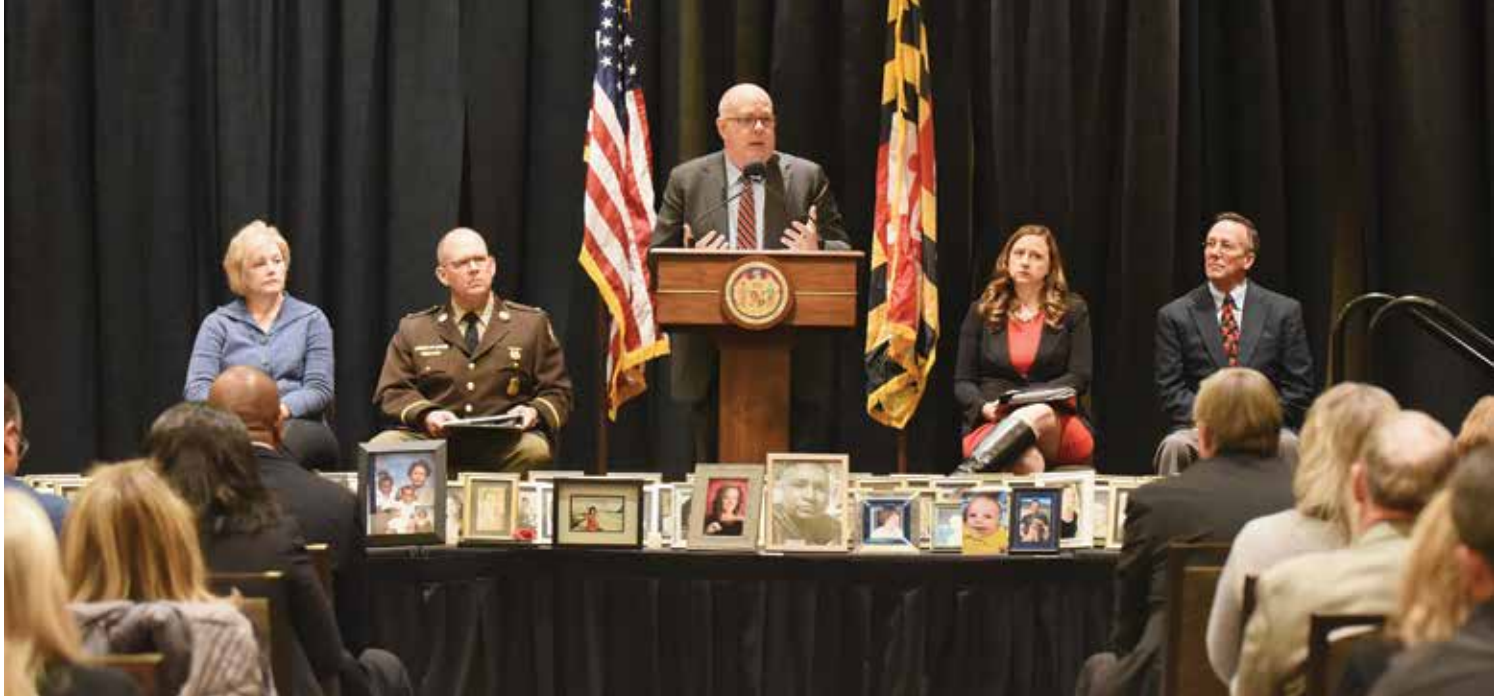
Maryland Governor Larry Hogan honors the state's victims of drunk driving at the November 21, 2022 "Maryland Remembers" ceremony in Annapolis.