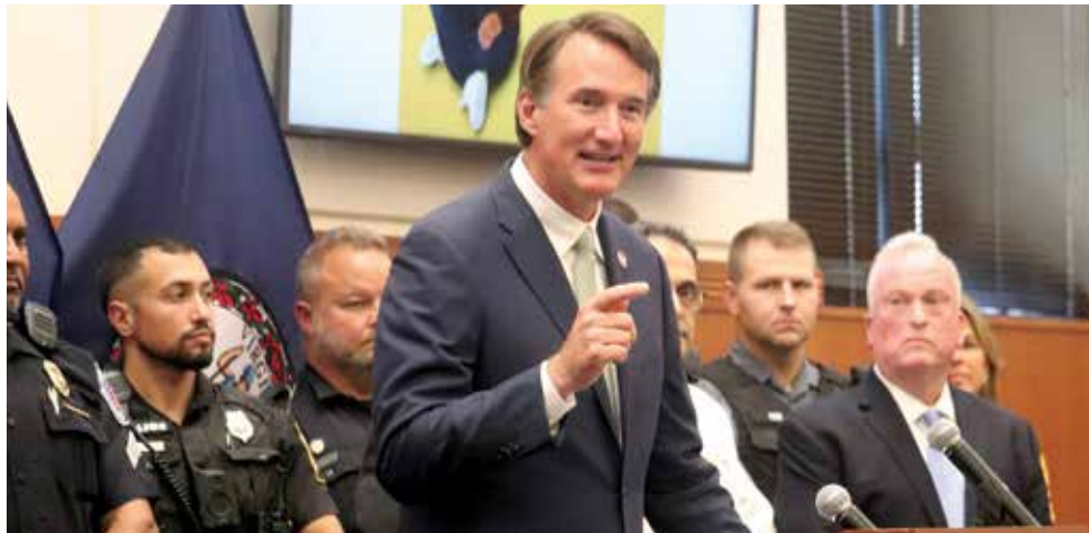
“It’s more important than ever that we continue our efforts to protect motorists traveling on Virginia’s roadways,”—Virginia Governor Glenn Youngkin On September 1, 2022 in Richmond helping launch the Commonwealth’s 2022 “Drive Sober or Get Pulled Over” (née Checkpoint Strikeforce) campaign. (WRAP serves as project director of partner the Virginia Department of Motor Vehicles’ 21st-annual, statewide anti-drunk driving effort.)

Markedly increased awareness of area DUI enforcement combined with the instilling of arranging for a safe ride home as a “core value” appear to be amongst the dividends of Virginia’s recent 2022 “Drive Sober or Get Pulled Over” (née Checkpoint Strikeforce) campaign (for which WRAP serves as project director). Virginia’s Checkpoint Strikeforce campaign, supported by a grant from the Virginia Department of Motor Vehicles to the nonprofit WRAP, commemorated its 21st anniversary in 2022.