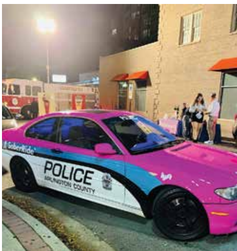
The region's SoberRide® vehicle is front-and-center at the Arlington County Police Department's October 29, 2022 interactive, anti-drunk driving Halloween event (co-staffed by WRAP) in Clarendon and where pledges from participants (and passersby) were collected to not drink and drive.